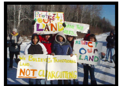
YOUTH BLOCKADE IN GRASSY NARROWS TERRITORY

Paper choices impact people not just forests and biodiversity. Abitibi is a major mill that provides paper for the U.S. book market - approximately 1/4 of the book paper consumed in the U.S. annually. Unfortunately, Abitibi is sourcing fiber from the traditional tribal lands of the Grassy Narrows Nation-lands that were defined in the Royal Proclamation of 1763, but are